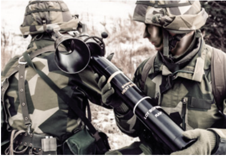
Loading 84 mm HEAT 551C RS