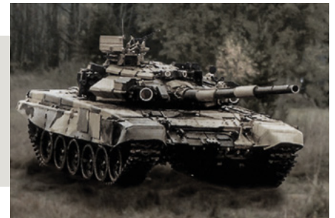
84 mm HEAT 551C RS target

The 84 mm HEAT 551C RS is highly effective against a wide range of armoured targets.