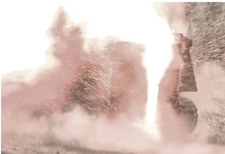
Effect in target