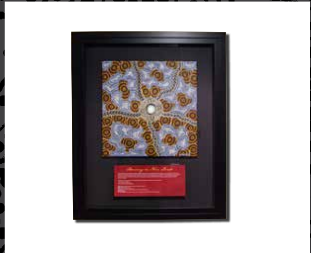
Canvas located in Canberra