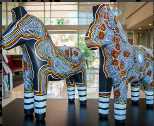
Identical Dala horses located in Sweden and South Australia.