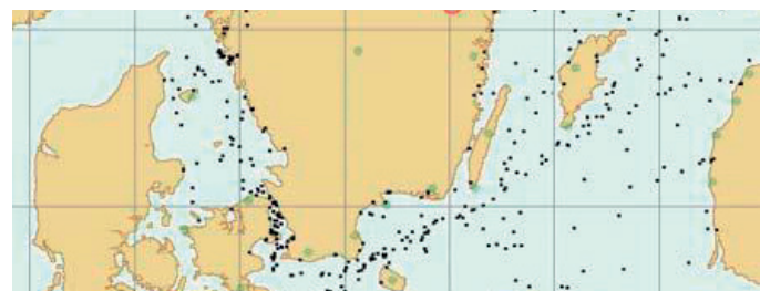
Plot from a flight test with Swedish military surveillance aircraft FSR890 at altitude 6000 m.