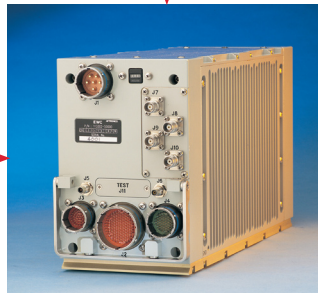
ELECTRONIC WARFARE CONTROLLER - Control management - System interface - DAC interface via CFDC - Dispenser management