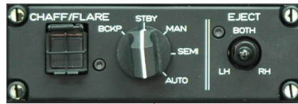
CONTROL PANEL - Mode and programme ordering