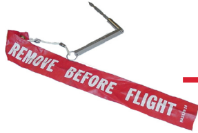
SAFETY SIGNALS - Safety pin - MASS, WOW etc.