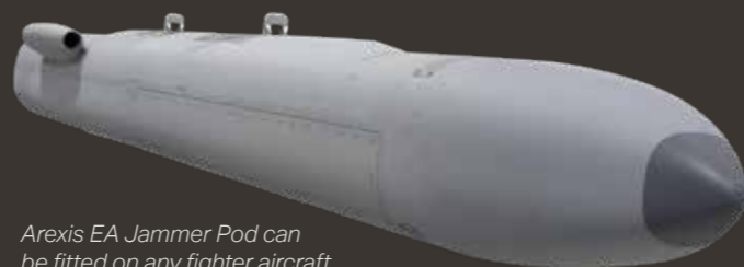
Arexis EA Jammer Pod can be fitted on any fighter aircraft. The architecture is proven on Gripen, Tornado and Saab's AEW&C platforms.

Precise direction finding combined with steerable AESA ECM antennas enables effective jamming of numerous simultaneous threats.